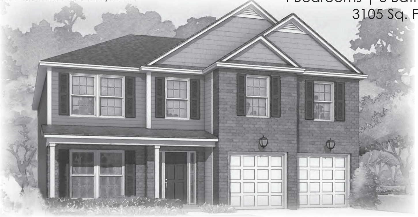
Optional Brick Elevation