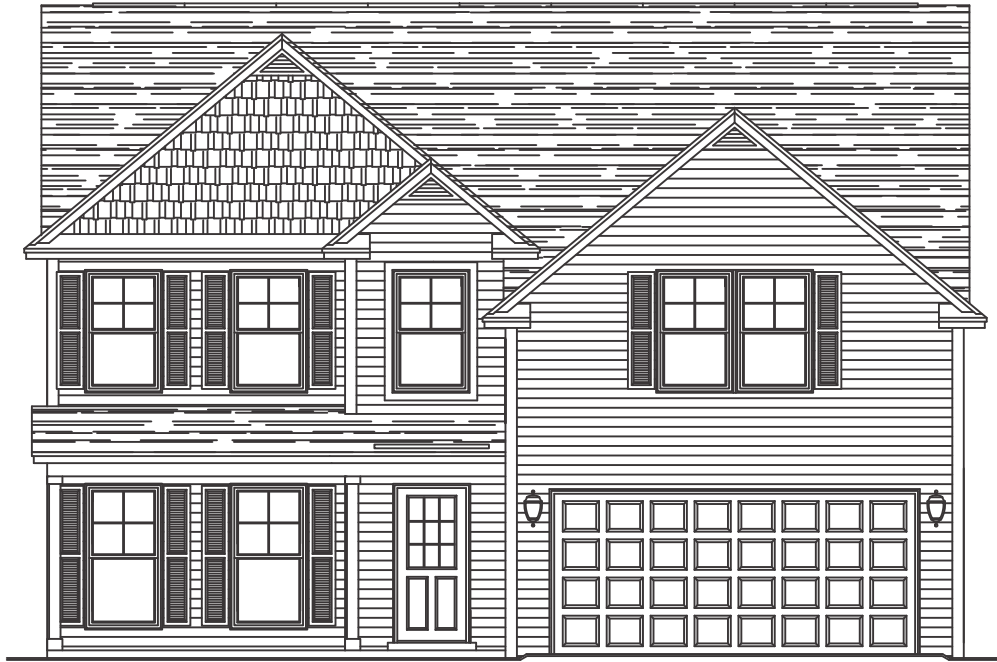
Optional Vinyl Elevation